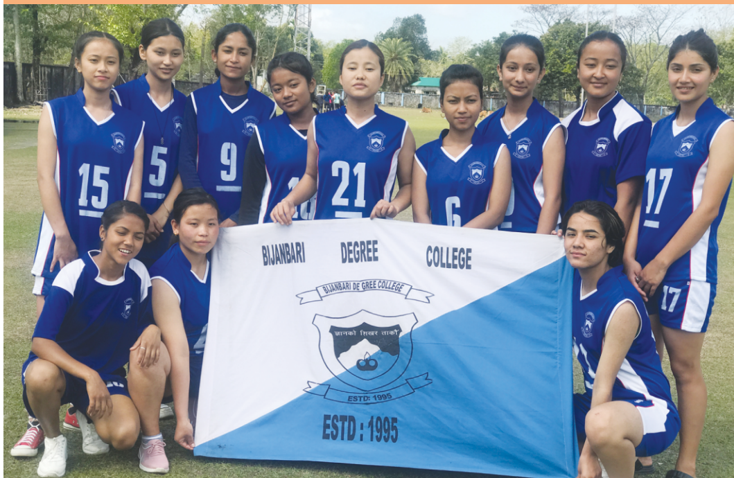
Kho-kho team, Bijanbari Degree College